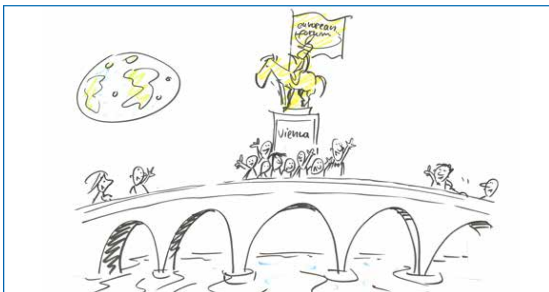
Illustration: Michael Hüter

From 10 to 12 September 2015, the General Assembly and International Conference of the European Forum took place in Vienna.